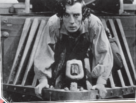
▲ THE GENERAL ◀ WOLF DADDY

THE KINO ROSSIJA PROGRAM delves into the new Russian cinema with its animation, fiction and documentary short films. We see constantly enthralling Russian displays of filmmaking prowess, especially within the screening dedicated solemnly to animation.